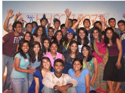
HSSC Counselors and Staff (First Session)

In 2007, we had 7 continuous weeks of summer camps starting from the last week of June up to the middle of August. During the camps, the ICC truly comes to "life". During each session (2 weeks long) of the Hindu Heritage Summer Camp, there were about 120 children (campers and counselors) staying at the ICC, learning about their heritage, religion etc. and having a good time. Sadhu Vaswani Camp had 60 campers this year and 18 counselors and staff.